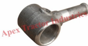
Part No. AP 531 Gear Gulli