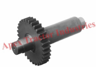
Part No. AP 157 Ideal Pin With Z-31