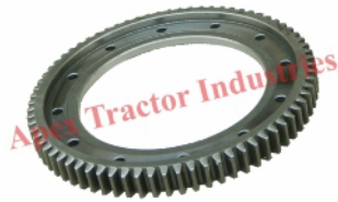
Part No. AP 204 A (Z-73 Crown 13", 19 No.) B (Z-73 Crown 13", 17 No.)