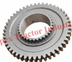
Part No. AP 504 Gear Z-47/32