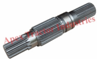
Part No. AP 217 Brake Shaft 12x22x21 Small