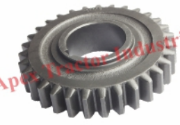
Part No. AP 104 Z-31 GDR (50, 47, 49, 49.5 Bore)