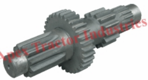
Part No. AP 304 Counter Complete 10T