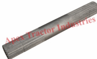
Part No. AP 533 Axle 22x22 Super All Size