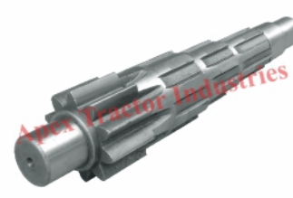
Part No. AP 519 Counter Shaft 10x8