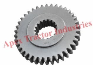
Part No. AP 1820 Gear Z-38x17