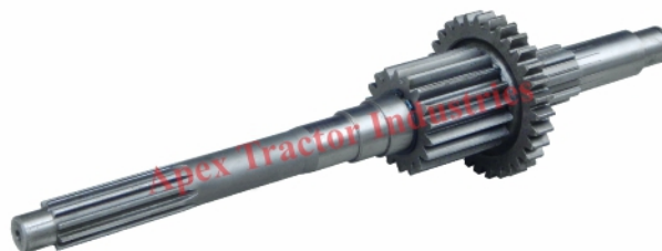
Part No. AP 151 A (Clutch Shaft 13x12, 24" Complete) B (Clutch Shaft 13x12, 22" Complete)