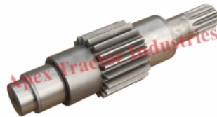
Part No. AP 401 4x4 Counter Shaft Only 12T & 20T