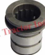
Part No. AP 703 14T Bush 5th