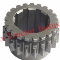
Part No. AP 500 1st Gear 21x8 Preet 5th Speed