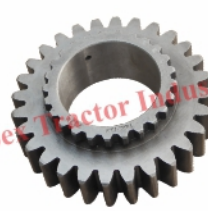
Part No. AP 506 Gear Z-28/25