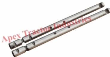
Part No. AP 214 Rod PTL Cut Type