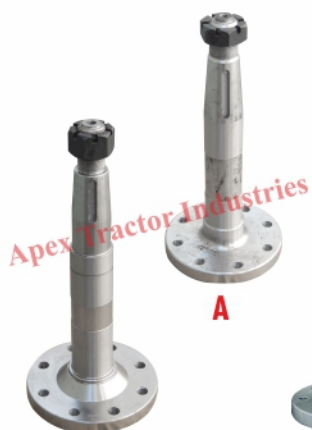
Part No. AP 130 A (3175 Shaft 10.5") Vishal B (3175 Shaft 11.5") Bharat C (3175 Shaft 13") Nabha Type