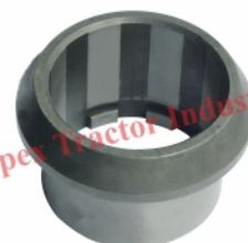
Part No. AP 516 Big Ring 8T