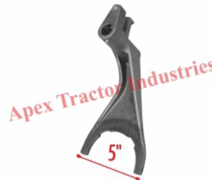
Part No. AP 529 Fork Medium