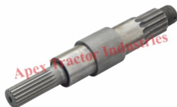
Part No. AP 1809 PTO Shaft Z-14x17 (L-295MM)