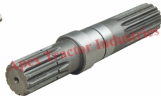
Part No. AP 215 Brake Shaft Old 12 x 16