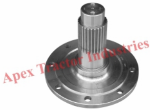
Part No. AP 527 Hub 28T