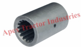
Part No. AP 136 A (Sleeve 16T) B (Sleeve 20T)