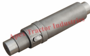
Part No. AP 158 Ideal Pin Only Shaft