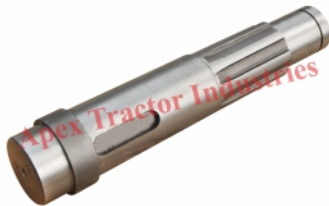
Part No. AP 404 4x4, 8T Shaft Vishal