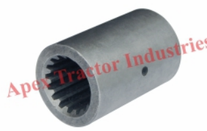
Part No. AP 216 A (Sleeve 16T) B (Sleeve 20T)