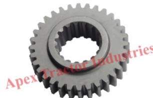
Part No. AP 202 Z-32/17 Counter Gear