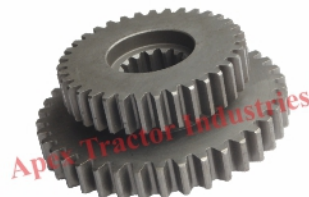
Part No. AP 201 Z-35/38 Double Gear