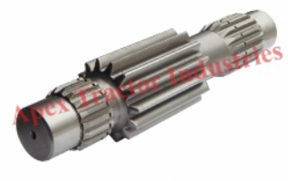
Part No. AP 221 A (Counter Shaft 14T) 100mm B (Counter Shaft 14T) 92mm Kartar Type