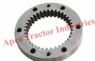
Part No. AP 809 Motor Crown Kartar Z-36