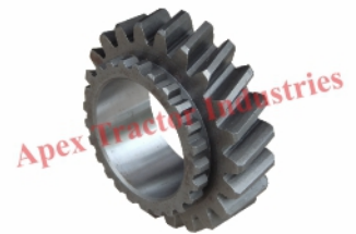
Part No. AP 607 Z-22/25