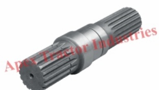
Part No. AP 121 Break Shaft 8.5" 16x16, 16x20 & 20x20