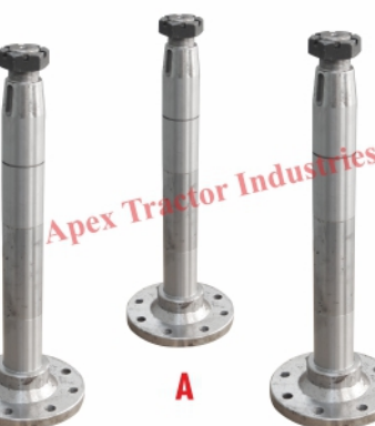
Part No. AP 133 A (3175 Shaft 16" Malkit) B (3175 Shaft 16" 6309 No.) C (3175 Shaft 16" Coller Type)