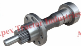
Part No. AP 312 Bell Housing Shaft 13" SPL.