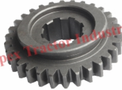
Part No. AP 102 2nd Gear GDR