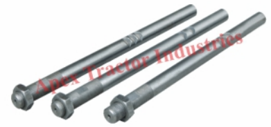
Part No. AP 523 Rod Preet 5th Length 14.5"