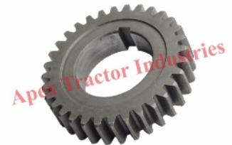
Part No. AP 308 Z-32 Dashmesh