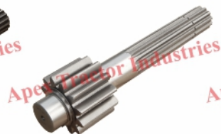
Part No. AP 224 Pinion 12x12 Extra Long Old Model