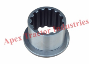
Part No. AP 622 14T Bush Deluxe