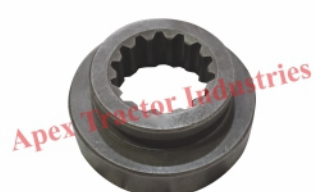
Part No. AP 1808-B Chain Gear Coupling