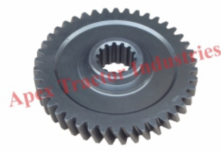
Part No. AP 602 Z-42/14 Counter Gear