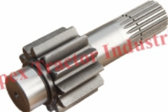
Part No. AP 115 A (Pinion 12x20 Small) B (Pinion 12x12 Small)