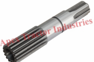
Part No. AP 1802 4x4 Shaft 16x6