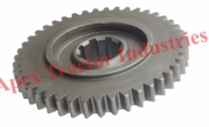
Part No. AP 103 3rd Gear GDR