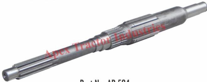
Part No. AP 524 Clutch Shaft 13x12 Preet 5th 27.5"