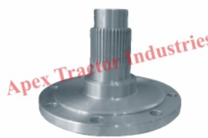
Part No. AP 220 Hub 39T