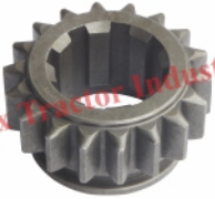
Part No. AP 101 1st Gear GDR