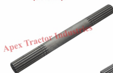
Part No. AP 1816 Axle Shaft Z-16x16 (L-382MM)