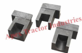
Part No. AP 613 Rod Gutka