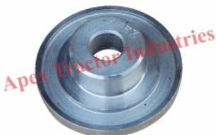
Part No. AP 804 Motor Cap Preet