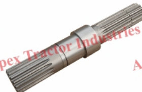
Part No. AP 313 Break Shaft 14x17