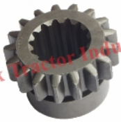
Part No. AP 700 1st Gear Z-17