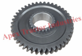
Part No. AP 601 Z-42/25