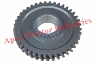
Part No. AP 603 Z-40/25