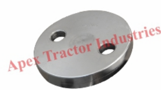
Part No. AP 137 Hub Tikki