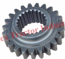
Part No. AP 508 Gear Z-23/22