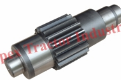
Part No. AP 113 Counter Shaft Only GDR