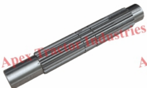
Part No. AP 311 14T Main Shaft SPL.