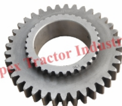
Part No. AP 505 Gear Z-37/32