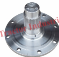
Part No. AP 314 Break Shaft 10.5" 16x16