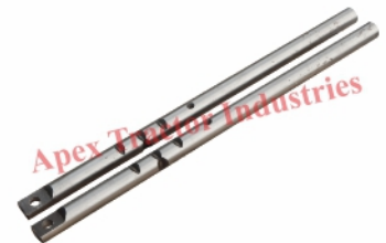
Part No. AP 310 Rod Dashmesh Length 19"