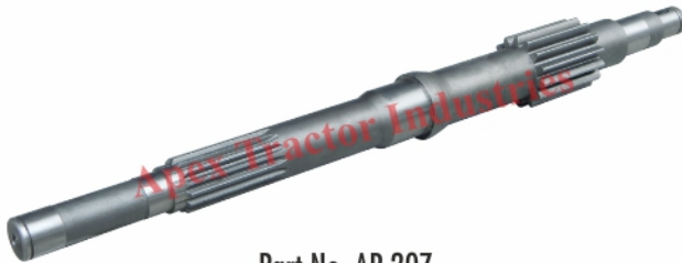
Part No. AP 207 Clutch Shaft Swaraj SPL