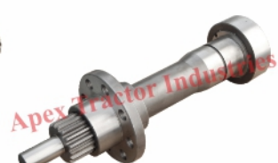
Part No. AP 119 A (MD Shaft 17T, 15") B (MD Shaft 12T, 15")