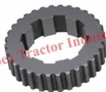
Part No. AP 501 Z-32/8T Ring