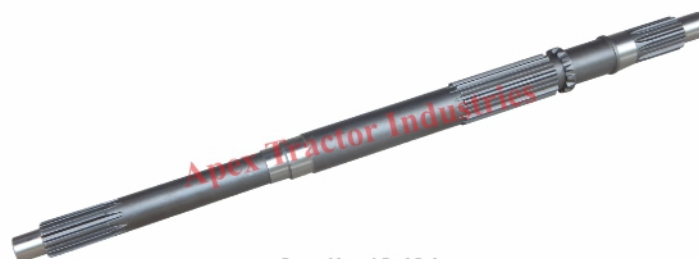
Part No. AP 614 Clutch Shaft Deluxe 30.5"