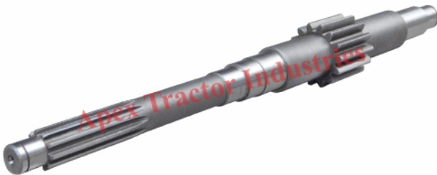
Part No. AP 307 Clutch Shaft 26.5" Dashmesh