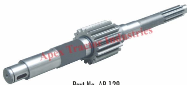
Part No. AP 129 A (Clutch Shaft 13x12, 24") B (Clutch Shaft 13x12, 22")