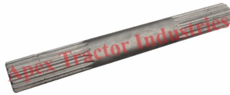
Part No. AP 625 Axle 14x14 Super All Sizes