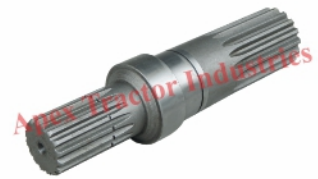
Part No. AP 209 Break Shaft 16x17 Small 9.5"