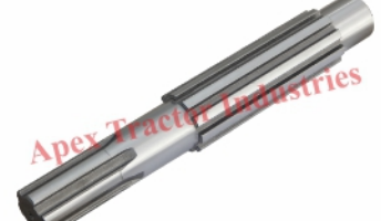
Part No. AP 1804 Shaft 10x6