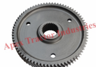
Part No. AP 618 Reduction Gear 75 x 28