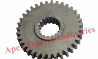
Part No. AP 203 Z-35/17 Counter Gear