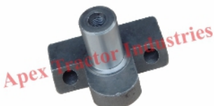
Part No. AP 808 Motor T Kartar