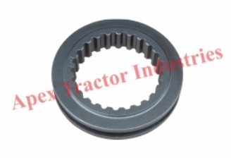
Part No. AP 623 25T Coupler Deluxe