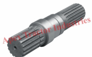
Part No. AP 122 Break Shaft 9.5" 16x16, 16x20 & 20x20