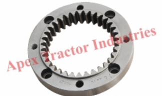
Part No. AP 803 Motor Crown Preet Z-34