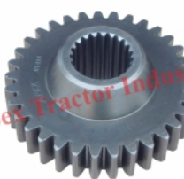
Part No. AP 510 Gear Z-33/21