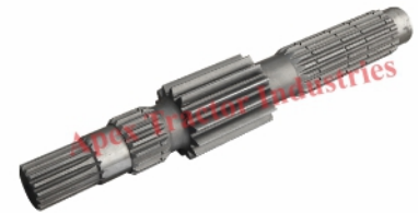
Part No. AP 711 4x4 Counter Shaft 5th Kartar