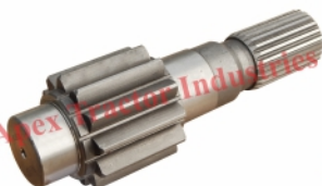
Part No. AP 815 Pinion 23x12