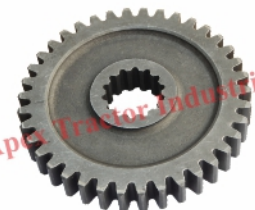
Part No. AP 318 Gear Z-38x14