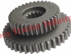
Part No. AP 701 Z-35x38 Double Gear