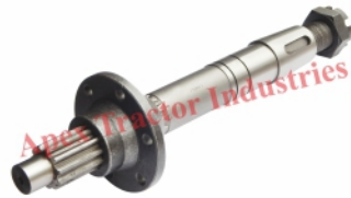
Part No. AP 140 MD Shaft Bharat 11T