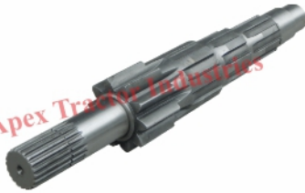
Part No. AP 520 4x4 Counter Shaft 10x8x20