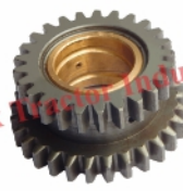
Part No. AP 702 Z-25x29 Complete