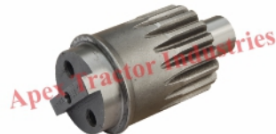
Part No. AP 801 A (Pinion 17T) B (Pinion 18T)