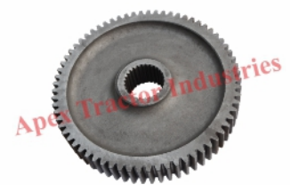
Part No. AP 526 Reduction Gear Z-68x28