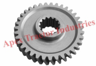
Part No. AP 605 Z-35/14