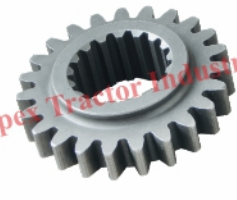
Part No. AP 709 Gear Z-23/17