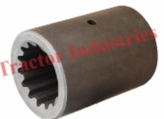
Part No. AP 315 Sleeve 14T