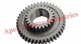
Part No. AP 156 A (Gear 24/43, 65 Bore) B (Gear 24/43, Sanik Bore)