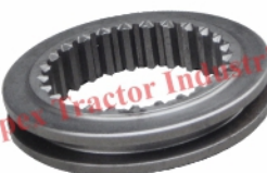
Part No. AP 512 Big Coupler 32T