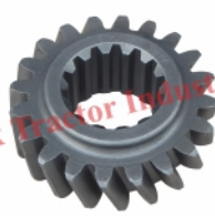
Part No. AP 610 Z-20/14