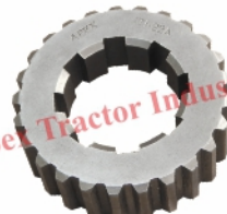
Part No. AP 202 Z-25/8T Ring