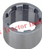
Part No. AP 514 8T Ring Small