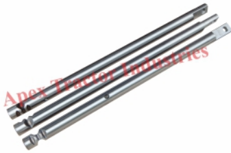
Part No. AP 621 Gear Rod Deluxe L-18"