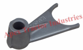
Part No. AP 127 Gear Shifter Fork