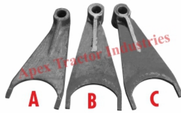
Part No. AP 620 Gear Fork Deluxe (A, B & C)