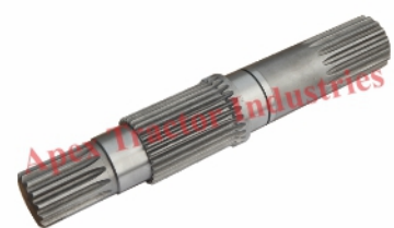
Part No. AP 615 Break Shaft 14x17x27