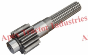
Part No. AP 222 Pinion 12x16 Kartar Extra Long Old