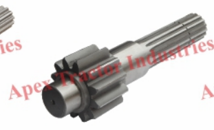
Part No. AP 225 Pinion 12x16 Preet