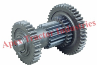
Part No. AP 150 Counter Complete 5th GDR