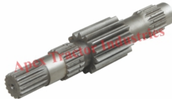
Part No. AP 405 4x4, Counter Shaft PTL 12T, 16T & 20T