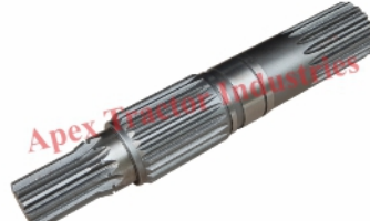
Part No. AP 219 Break Shaft 12x22x17 Old Model