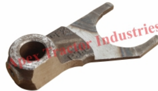
Part No. AP 309 Fork Dashmesh