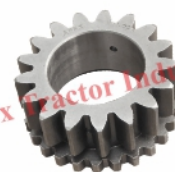
Part No. AP 507 Gear Z-17/25