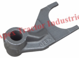
Part No. AP 706 Fork 5th Kartar