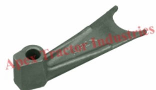
Part No. AP 154 Fork GDR 5th