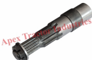
Part No. AP 1805 PTO Shaft 16x10