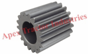
Part No. AP 135 Z-18 Gear Only