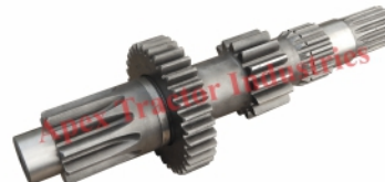
Part No. AP 306 4x4 Counter Complete Dashmesh