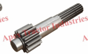
Part No. AP 223 Pinion 12x16 Kartar Extra Long New Model