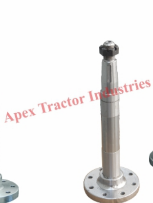
Part No. AP 131 A (3175 Shaft 13" 6309 No.) B (3175 Shaft 14" Kartar) C (3175 Shaft 14" Nabha Type)