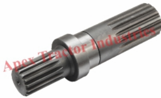
Part No. AP 210 Break Shaft 16 x 17 Long 10"