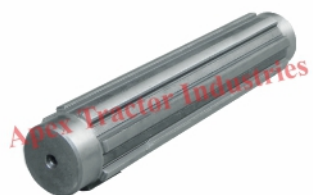
Part No. AP 126 Main Shaft 8T