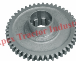
Part No. AP 503 Z-47/8T Counter Gear