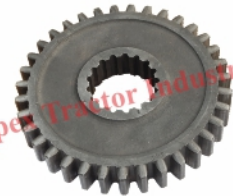
Part No. AP 303 Gear 35x17