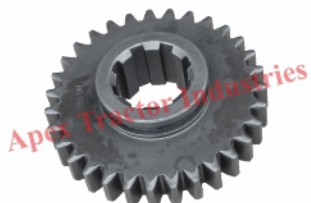
Part No. AP 153 Z-31, 8T 5th Gear