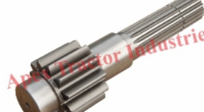
Part No. AP 116 Pinion 12 x 16 Long 10 No.