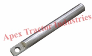
Part No. AP 1818 Shifting Rod (L-173MM)