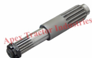
Part No. AP 1811 PTO Shaft Z-14x16 Dia 48MM (L-265MM)