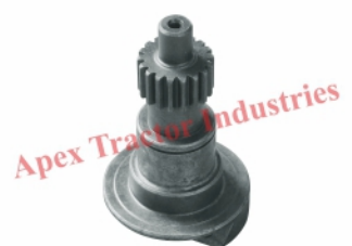
Part No. AP 807 Motor Came Kartar