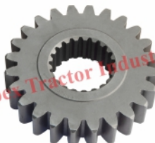
Part No. AP 509 Gear Z-24/21