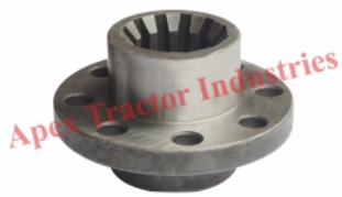
Part No. AP 139 MD Coupling 12T & 14T