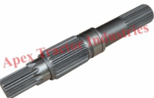
Part No. AP 218 Break Shaft 12x22x21 Long