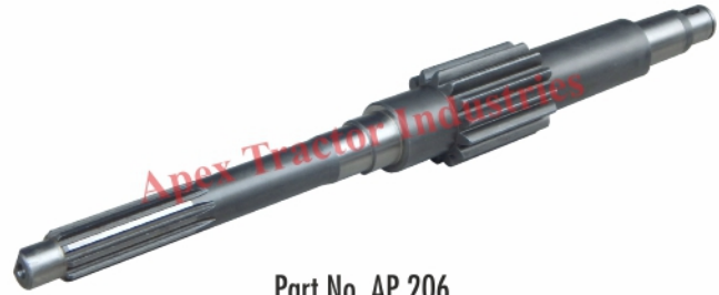
Part No. AP 206 A (Clutch Shaft 13x12, 26.5") 100mm B (Clutch Shaft 13x12, 26.5") 92mm Kartar Type