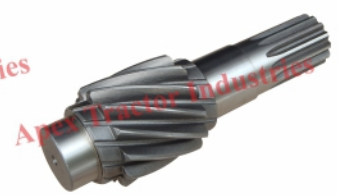
Part No. AP 612 Pinion 12x14 Deluxe