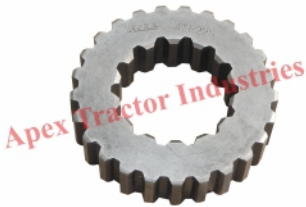
Part No. AP 624 25x14 Ring Deluxe