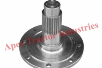
Part No. AP 619 Hub 28T Heavy