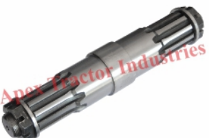
Part No. AP 1806 PTO Shaft 10x10