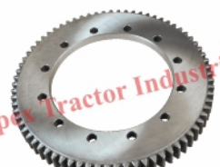
Part No. AP 120 Z-73 Crown 12" Plain 12 Hole