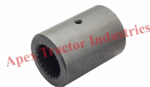
Part No. AP 1817 Sleeve 22T (L-64MM)