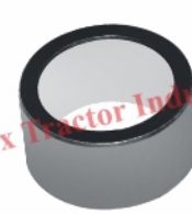
Part No. AP 515 Plain Bush