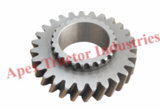
Part No. AP 606 Z-27/25