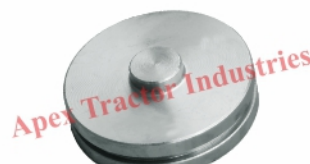
Part No. AP 810 Motor Cap Kartar