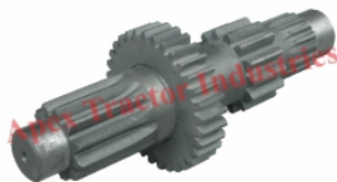
Part No. AP 305 Counter Complete 11T