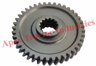
Part No. AP 604 Z-40/14