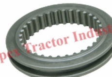
Part No. AP 513 Small Coupler 25T