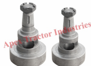
Part No. AP 806 A (Motor Shaft Preet) B (Motor Shaft Kartar)