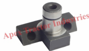
Part No. AP 802 Motor T Preet