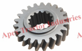
Part No. AP 608 Z-22/14