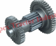
Part No. AP 112 Counter Complete GDR