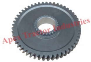
Part No. AP 600 Z-50/25 2nd Gear