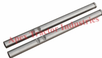
Part No. AP 532 Rod Groove Type