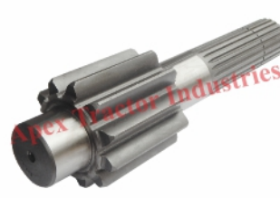
Part No. AP 518 Pinion 11x22