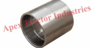
Part No. AP 805 Glassi