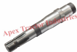
Part No. AP 1819 PTO Shaft 6T