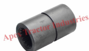
Part No. AP 1810 Sleeve 17T (L-72MM)