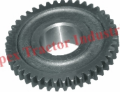
Part No. AP 107 Z-43 GDR Sainik Bore