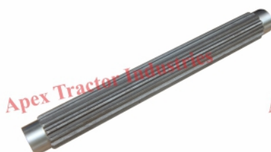
Part No. AP 616 14T Main Shaft Deluxe