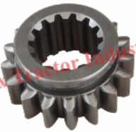
Part No. AP 300 1st Gear Dashmesh