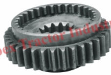
Part No. AP 301 2nd Gear 35/31/14