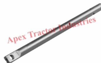
Part No. AP 128 Gear Shifter Rod Length 13"