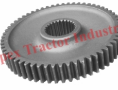
Part No. AP 109 Reduction Gear 59x39, 59x26, 59x25