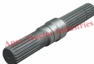
Part No. AP 123 Break Shaft 11.5" 16x16, 16x20 & 20x20