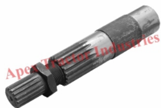
Part No. AP 1813 Shaft Z-18x16 (4x4) L- 280MM