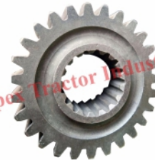
Part No. AP 710 Gear Z-27/17