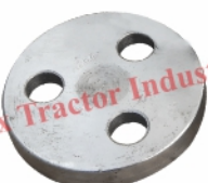
Part No. AP 316 Hub Tikki