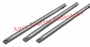
Part No. AP 707 Rod 5th Kartar Length 20"