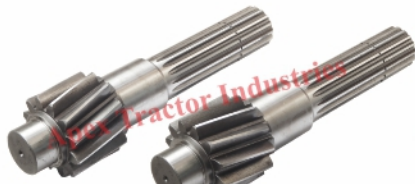
Part No. AP 118 A (Pinion Helical 12x16) Left B (Pinion Helical 12x16) Right