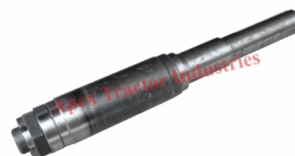
Part No. AP 134 Front Auger Shaft 16T