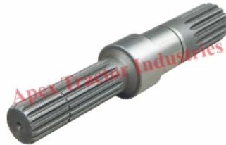
Part No. AP 211 Break Shaft 16 x 17 Old Model Long 13"