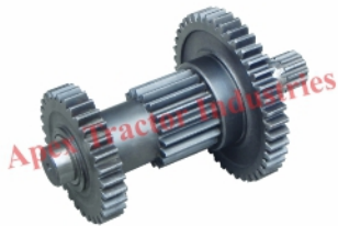
Part No. AP 400 4x4 Counter Complete 12T & 20T