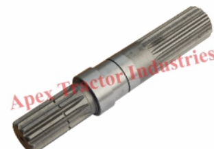
Part No. AP 124 Break Shaft 10.5" 16x16