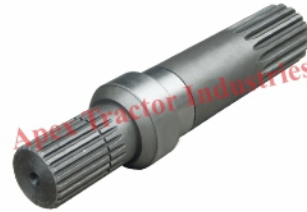
Part No. AP 522 Break Shaft 17x22 Big