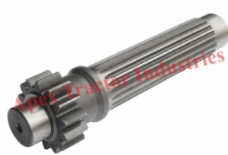
Part No. AP 517 21x14 Spline Shaft