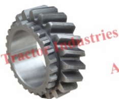
Part No. AP 609 Z-20/25