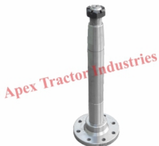
Part No. AP 132 3175 Shaft 15" Hind