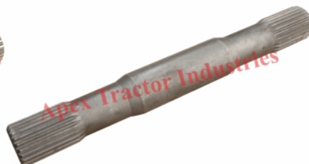
Part No. AP 816 Axle 23x23 (Length 330mm)