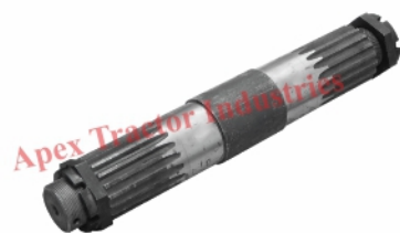
Part No. AP 1812 Shaft Z-18x18 (L-315MM)