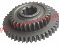
Part No. AP 105 2nd & 3rd Fix Gear GDR 30x43