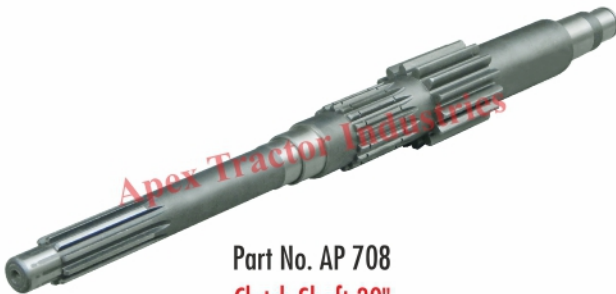
Part No. AP 708 Clutch Shaft 30"