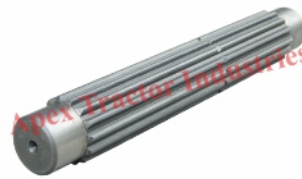
Part No. AP 208 14T Main Shaft