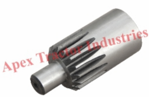
Part No. AP 1801 J.D. Coupling Small, Long