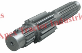
Part No. AP 704 Counter Shaft 5th Kartar