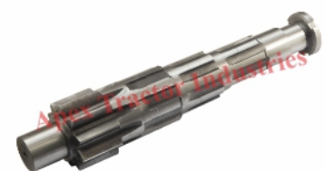
Part No. AP 534 Counter Shaft 10x8 With Thread