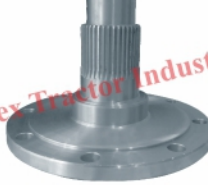
Part No. AP 110 Hub GDR 39T, 26T, 25T