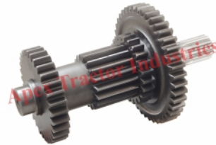
Part No. AP 402 4x4, 5th Counter Complete 12T & 20T GDR