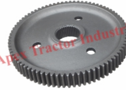
Part No. AP 108 Reduction Gear GDR Z-79x39