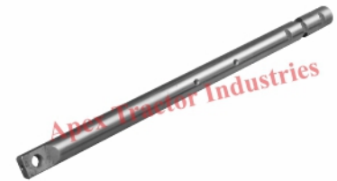
Part No. AP 213 Rod PTL Preet Type Length 16"