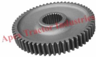
Part No. AP 205 Reduction Gear 59 x 39