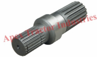
Part No. AP 521 Break Shaft 17x22 Small