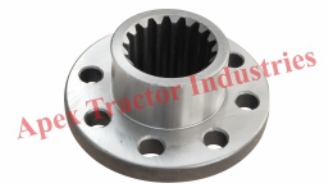
Part No. AP 138 MD Coupling 17T