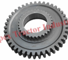
Part No. AP 302 3rd Gear 31/41