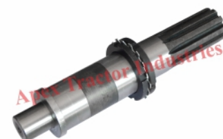
Part No. AP 1807 PTO Shaft 10T