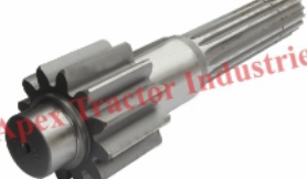
Part No. AP 114 12 x 16 Pinion Long GDR