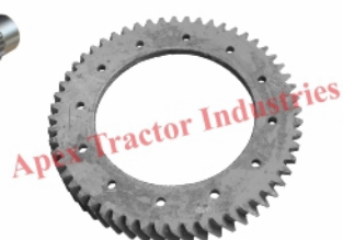
Part No. AP 617 Z-56 Crown Deluxe