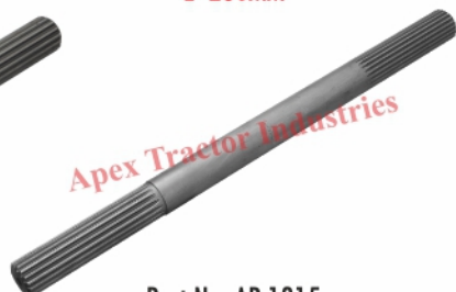
Part No. AP 1815 Axle Shaft Z-22x17 (L-440MM)