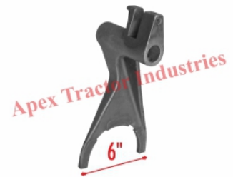
Part No. AP 530 Fork Big