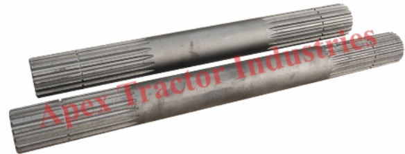
Part No. AP 141 Axle 16x16, 20x20, 16x20, 12x12 Super All Sizes