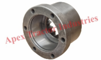
Part No. AP 403 4x4, Z-18T Housing Vishal Type