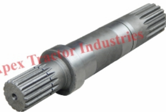
Part No. AP 705 Break Shaft 16x17 Spl.