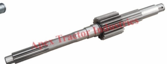
Part No. AP 152 A (Clutch Shaft Only 13x12, 24") B (Clutch Shaft Only 13x12, 22")