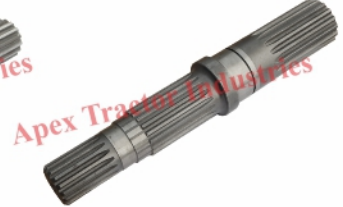
Part No. AP 226 Oil Brake Shaft Kartar SPL.