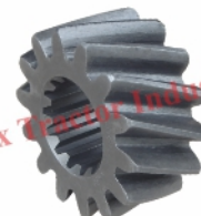
Part No. AP 611 Z-14/14 1st Gear