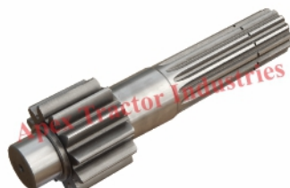
Part No. AP 317 A (Pinion 12x14 Dashmesh) B (Pinion 12x14, 10 No.)