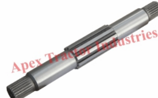
Part No. AP 1803 Shaft 4x4 - 22x10x22