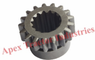
Part No. AP 200 1st Gear Z-17 PTL