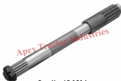
Part No. AP 1814 Shaft Z-14x16 Dia 48MM (L-442MM)