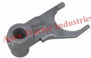
Part No. AP 212 Fork PTL