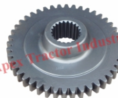
Part No. AP 511 Gear Z-44/21