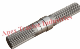
Part No. AP 125 Break Shaft 12.5" 16x16 & 12x16