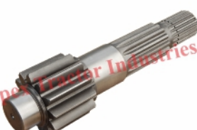
Part No. AP 117 A (Pinion 12x14x16) B (Pinion 12x14x20)