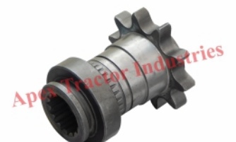
Part No. AP 1808-A Chain Gear Set Z-10x28