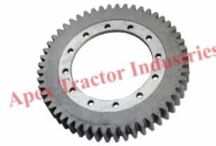
Part No. AP 525 Z-52 Crown