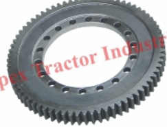
Part No. AP 111 Z-73 Crown GDR 18 Hole 12" O/M