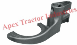
Part No. AP 528 Fork Small