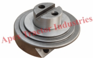
Part No. AP 800 Came Preet