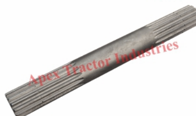
Part No. AP 319 Axle 14x14 Super All Sizes